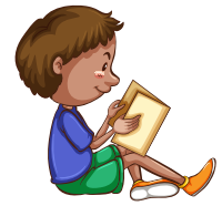
reading a book