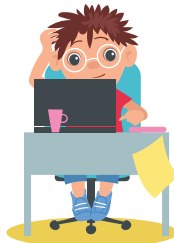
reading an article