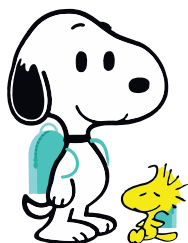
Get on school bus

Draw a line from each activity to the time of day