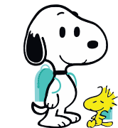
Get on school bus